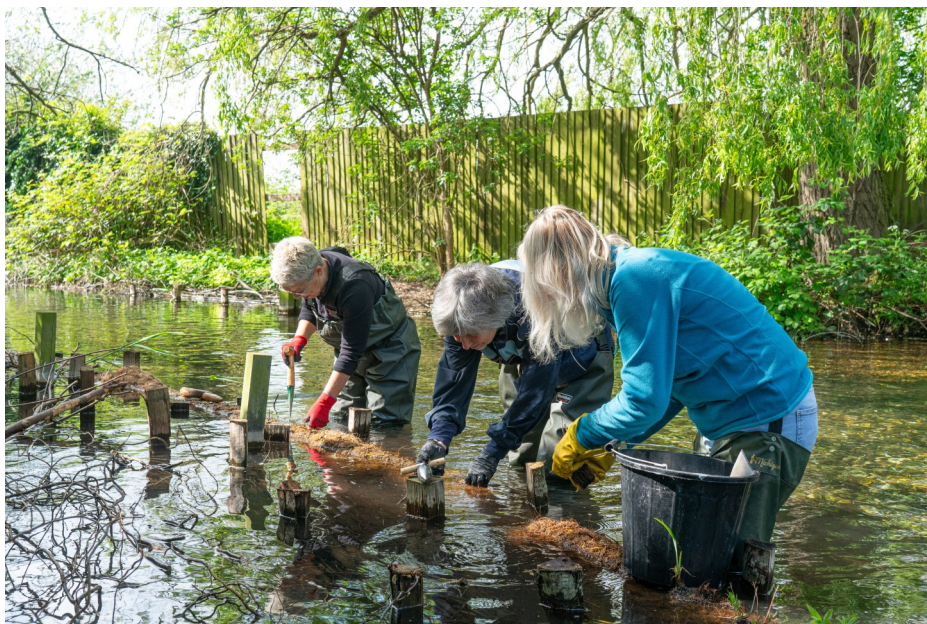
Volunteers planting coir rolls with aquatic plants in the Duck Pond

In the Duck Pond, volunteers in waders have been busy strategically placing coir rolls (made of sustainable waste from coconut shell husk) on top of the brushwood faggots (that were installed last year), to speed water flow and protect the banks. The rolls have been planted with plug plants and wire mesh has been temporarily installed to deter the ducks from nibbling them. It is anticipated that it will take at least two years before there is a good coverage of foliage but we hope to get some wetland flowers later in the summer which will encourage the insects.